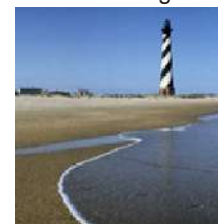
Walk the Beach