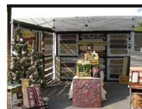
Art & Craft Shows