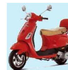
Ride a Scooter